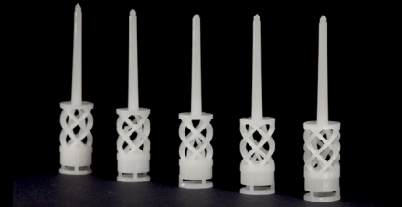
Step 3: Uniformly remove the mold

Fill the molds with the material of choice using your standard injection molding machine.