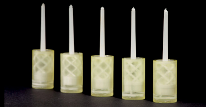
Step 2: Inject material

A patented 3D printing platform let you produce the most advanced molds.